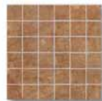
2" x 2" Mosaics (Mesh Mounted 12" x 12")