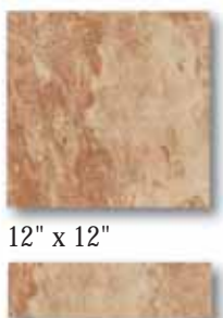
12" x 12"