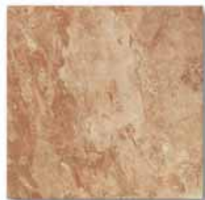
18" x 18"