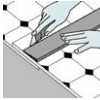
“Cutting the seam”