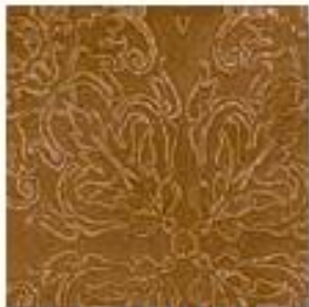
Austin Antiquity Blossom 568