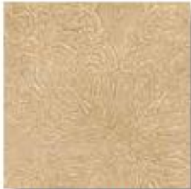
American Heritage Blossom 535