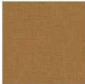
Austin Antiquity Capris 568