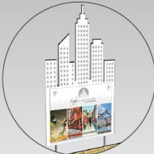
City header diecut from plexi