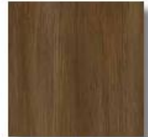
American Heritage Tara 544