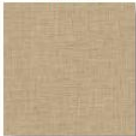
California Dreaming Capris 538