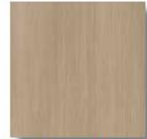
Charleston Charm Tara 537