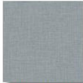
Charleston Charm Capris 572