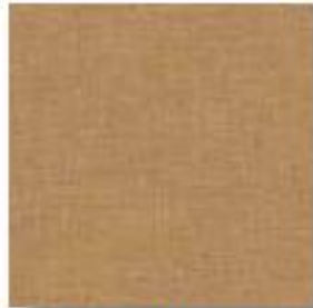
American Heritage Capris 547