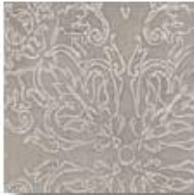
Soho Sensation Blossom 593