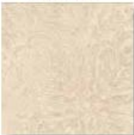
California Dreaming Blossom 536