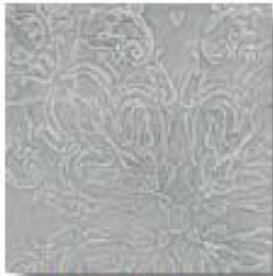
Charleston Charm Blossom 572