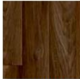
American Heritage Liberty 738