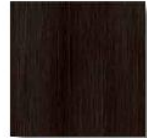
Soho Sensation Tara 599