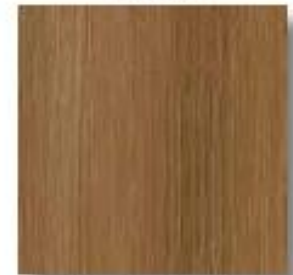
California Dreaming Tara 543