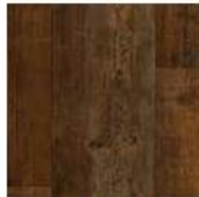
Austin Antiquity Longhorn 818