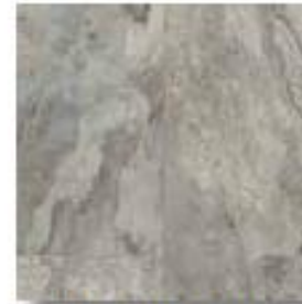
Charleston Charm Naples 575