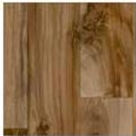
California Dreaming Hollywood 747