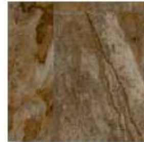
American Heritage Naples 547