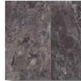
Soho Sensation Naples 598