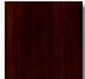
Austin Antiquity Tara 574