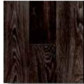
Soho Sensation Central Park 788