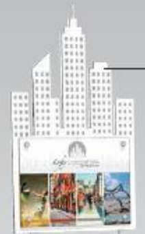
Size: app. 21" w x 35.5" h City diecuts from Frosted plexi