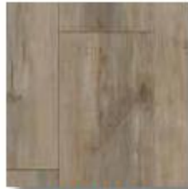
Charleston Charm Harbor 532