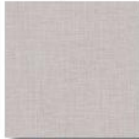
Soho Sensation Capris 590