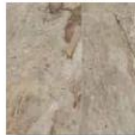
California Dreaming Naples 548