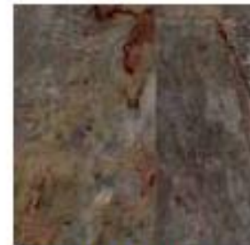
Austin Antiquity Naples 596